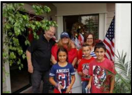
The children from Glenknoll Elementry provided welcome baskets for the families visiting the Re-Entry Lodge, THANK YOU KIDS!!!