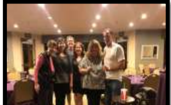
Thank you for your generosity Yorba Linda Sunrise Rotary!