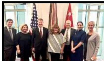
At the Pentagon for the Investiture as a Civilian Aide to the Secretary of the Army, November 7, 2017