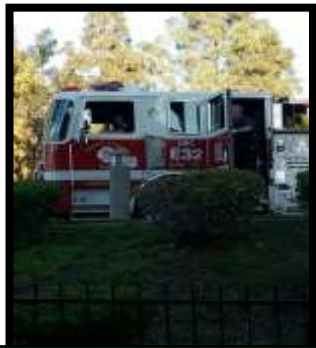
Pecans in the stuffing caused an allergy concern, but all turned out