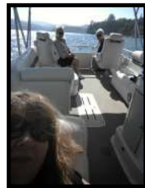
The New Boat!