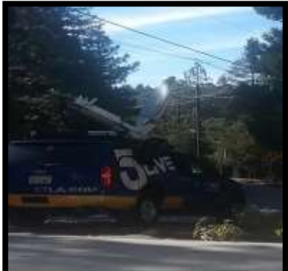
KTTLA 5 Interview at The Re-Entry Lodge