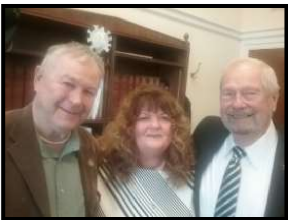
In Washington, D.C., meeting with Rep Dana Rohrabacher to talk with him about FFAM!