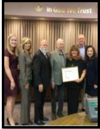
Yorba Linda City Council Receiving Recognition