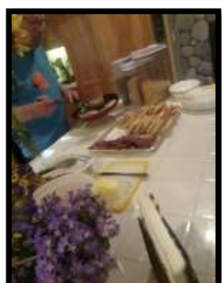
Great Military Families!